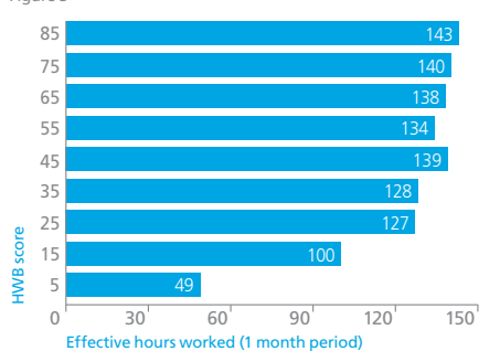
Health and well-being score vs effective working hours Figure 3

The results show a clear link between a worker's health and productivity with the healthiest employees nearly three times more effective than the least healthy. A worker with a high HWB score worked approximately 143 effective hours compared to 49 effective hours worked per month for a worker with a low HWB score (Figure 3).