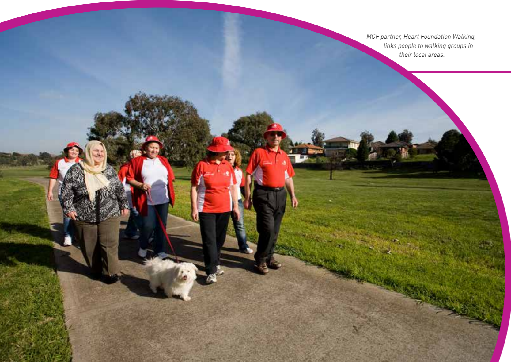
MCF partner, Heart Foundation Walking, links people to walking groups in their local areas.