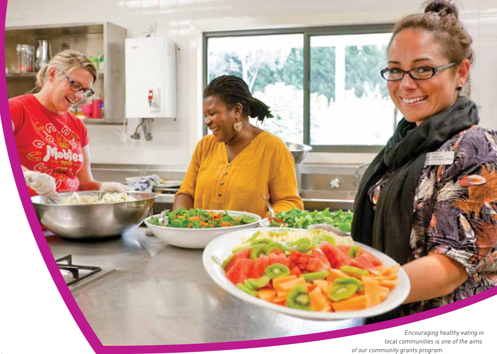
Encouraging healthy eating in local communities is one of the aims of our community grants program.