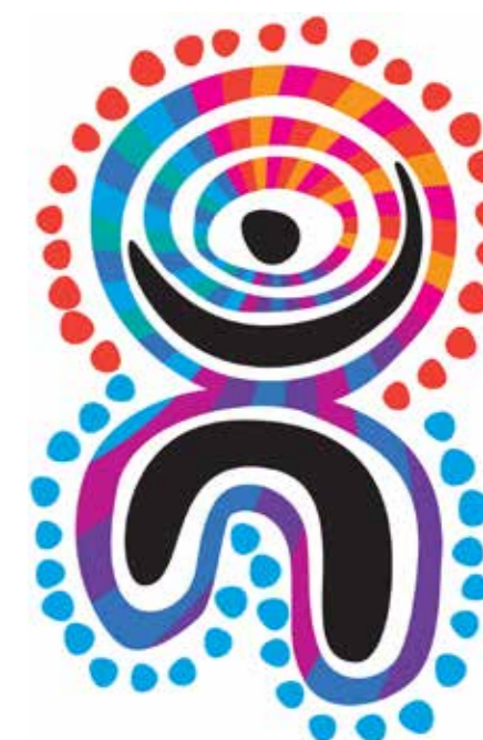
Our Indigenous commitment was lifted in 2013 with the release of our second RAP and a new Indigenous grants program.

Since launching in 1983, Jump Rope for Heart has involved more than eight million young people.